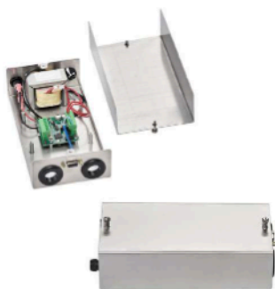
Universal Valve Module