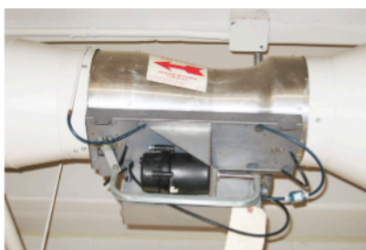
Existing Valve System