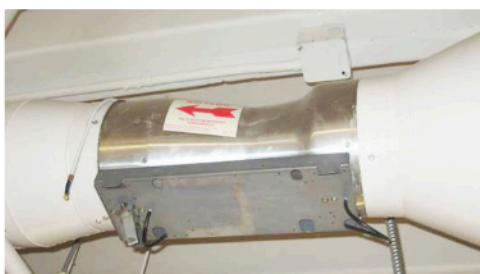
Actuator and Linkage Removed