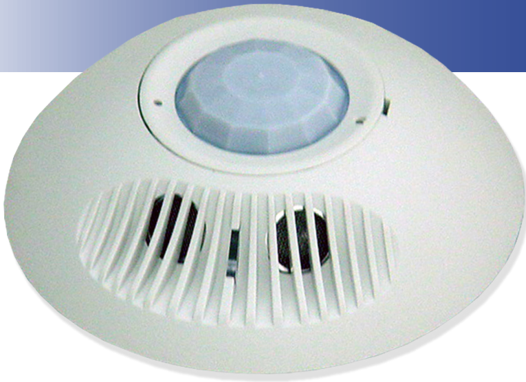
LP-IR-DT Infrared Motion Sensor

Triatek's LP-IR-DT Infrared Motion Sensor provides the maximum motion detection available in sensors on the market. This microprocessor-based sensor is self-adjusting and self-calibrating. Simply mount the LP-IR-DT, and after a four week data collecting period the sensor will self-adjust for optimal energy savings. These settings are saved in non-volatile memory so they are not lost during power failure.